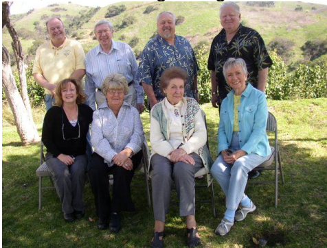
Most of our current Directors

With the New Year come new blessings. We welcome new members to our Board of Directors. Overcomers is truly fortunate to have such talented volunteers giving of their valuable time as they help guide the ministry forward with new insight as we move through the challenging times at hand. New fund raising and outreach efforts are being developed as the ministry grows, and we are growing!