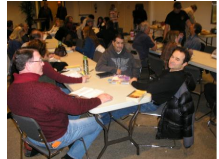
“Great chili ... now, where’s the cake?”

The South Lake Tahoe group at Sierra Community Church had a 20 year anniversary party with a “chili bar” pot luck and a chance to share a “scripture of the year” (instead of a New Year resolution). The event was well attended (about 50 people) and a good time was had by all.