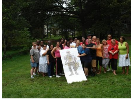
Some Elizabeth NJ members at a recent retreat