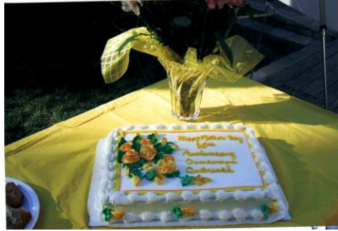
25 yr. Cake at the bake sale

In San Fernando, CA, the group had a “Taco Feed” with a speaker and group participation to celebrate OO's 25 th anniversary of ministry. A donation was made to the Central Office and there was a good turnout.