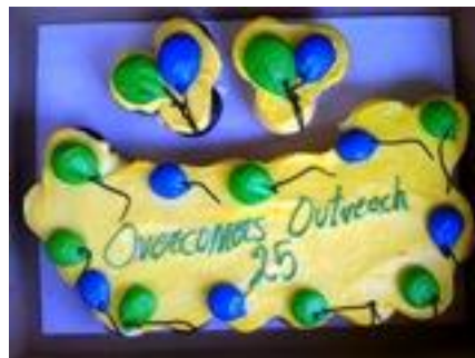
There was a lot of cake!

Simi Valley groups got together on a sunny Saturday for a picnic at the park. Worship, fellowship, and a lot of fun on a beautiful day - does it get any better?