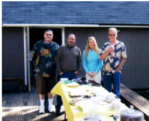
Bakers and helpers

South Lake Tahoe, CA, held a bake sale which was a big success. Cookies, cakes and pies all sold to raise awareness of the help that Overcomers offers to all.